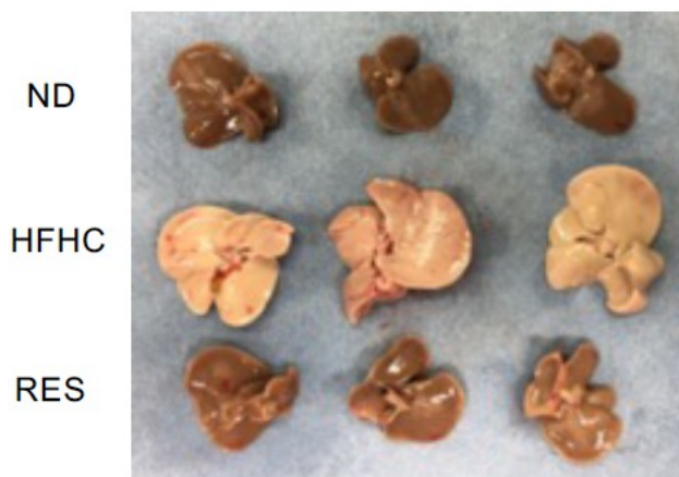
Figure 1. Livers of ND, HFHC, and RES mice 8 weeks following switching RES mice to a normal diet. Image adapted from Koda et al. 2021, Nat. Commun. under a CC BY 4.0 license.